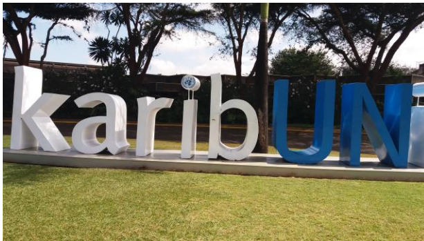
Karibuni sign used to welcome visit

The tour at the UN headquarters began at 10 A.M with a walk between the flags of the 193 member states of the United Nations which were arranged in alphabetical order with the Afghanistan flag being the first and the Zimbabwean flag being the last. A great big welcome sign was placed at which was an initiative of the Protocol Team as a sign of hospitality.