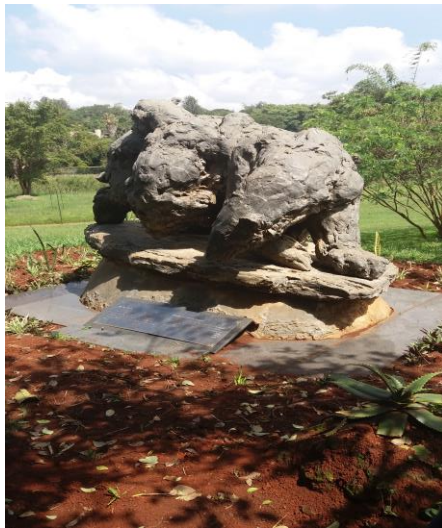
Sculpture representing polar bears on a melting iceberg due to global warming

The tour was a great eye-opener of the real state of the earth. It has awakened great insights in me and has prompted me to think of better ways to conserve the environment as it is a precious gift. It has also led me to know the harmful effects of pollution and how it affects other living beings apart from human beings. It has also led to my being aware of my surroundings and how to better the state of the environment.